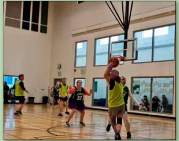
Last week, H.A. Kostash School was the site of an exciting basketball game that had everyone on the edge of their seats. In a fun and friendly competition, the school’s basketball teams went head-to-head against a team of RCMP officers and a few teachers.