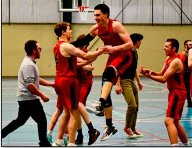
The Thorhild Bulldogs celebrate their win!