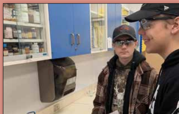
Grade 11 science students at Redwater School delved into hands-on learning as they investigated evidence of chemical reactions and practiced titration techniques.