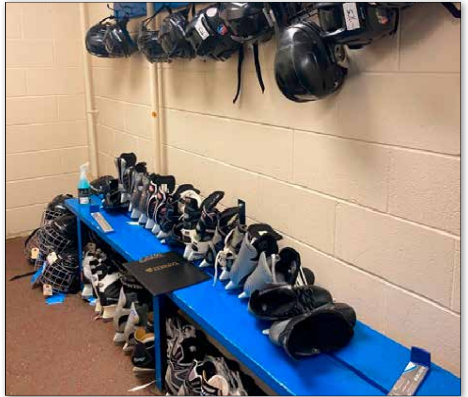
A sample of the skates and helmets that the Thorhild Agricultural Society has on hand for public rentals.

They look forward to seeing everybody at the rink, and urge everyone to come out, have fun, and take part in the exciting winter sports that Thorhild County has to offer.