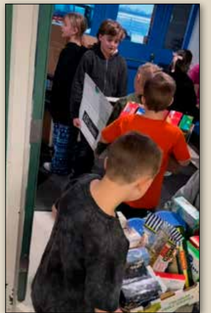
The students of Ochre Park School's Classroom of the Month, 3/4 W, demonstrated exceptional dedication by ensuring their food donations reached the local food bank. Their efforts reflect the school's commitment to fostering a spirit of giving and teamwork among its students.