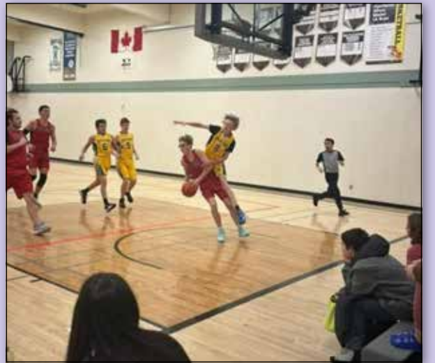
Congratulations to Thorhild Central's Senior High Boys' basketball team for securing second place at the Daysland tournament. The team displayed incredible determination, battling hard in a thrilling final game that went into overtime. The school community is immensely proud of their effort and sportsmanship!