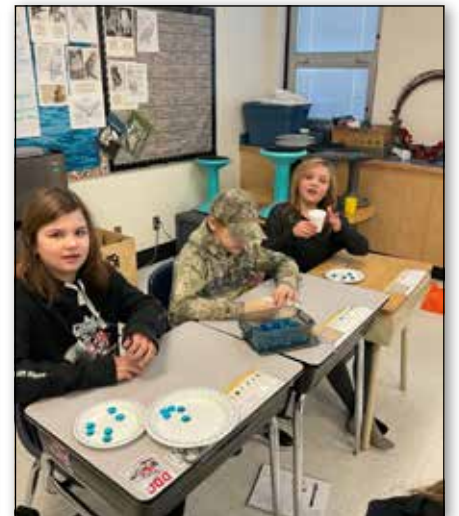
Grade 4 students at Thorhild Central School recently embraced collaborative learning in both math and language arts. In math, they explored the concepts of sets and sharing by counting and dividing various items, providing an engaging introduction to their division unit. Meanwhile, in language arts, students played an interactive word game called "Jingo" to review action words (verbs). They listened to clues, identified the matching verb, and marked it on their Jingo cards, turning learning into a fun and educational experience. These hands-on activities encouraged teamwork, critical thinking, and active participation, making the classroom an exciting place to learn.