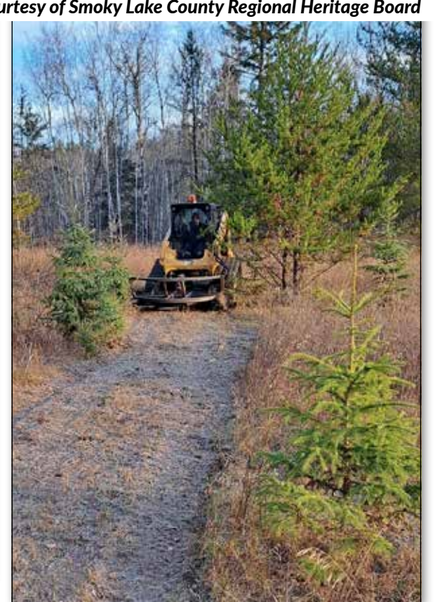
A bobcat mulcher came through in October 2024 to create the new nature trail.

to create the defined and enjoyable outdoor path. While the nature trail currently remains unnamed, there is a plan in place for public input later this season, allowing community