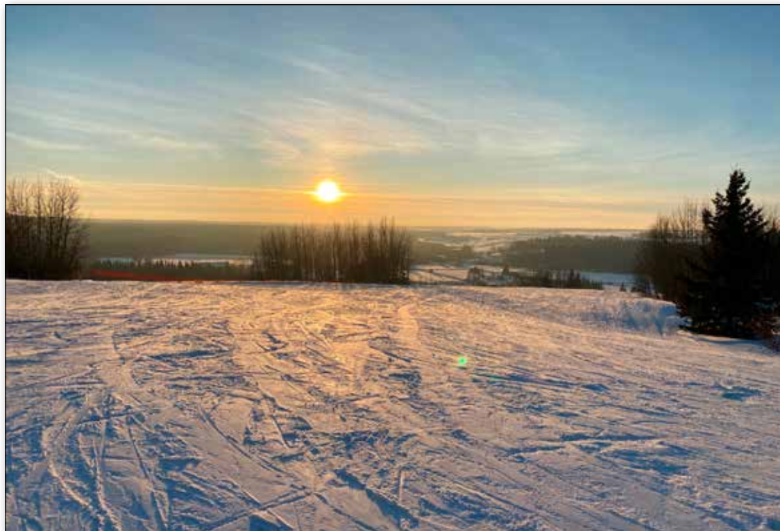
The sun sets on the winter solstice, December 21, 2024. Historically, a symbol of the beginning of a New Year.