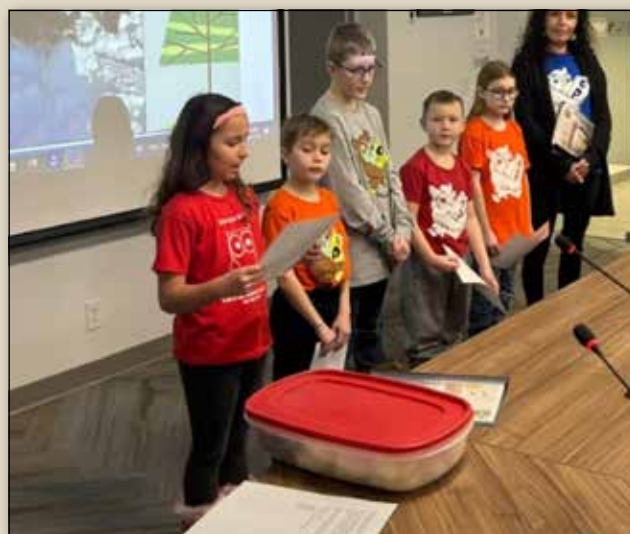
A group of little owls from Ochre Park School recently visited the Sturgeon Public School Division to present to the Board of Trustees and Senior Administration. Their presentation highlighted the Ochre Park School Place Study and Outdoor Learning initiative.