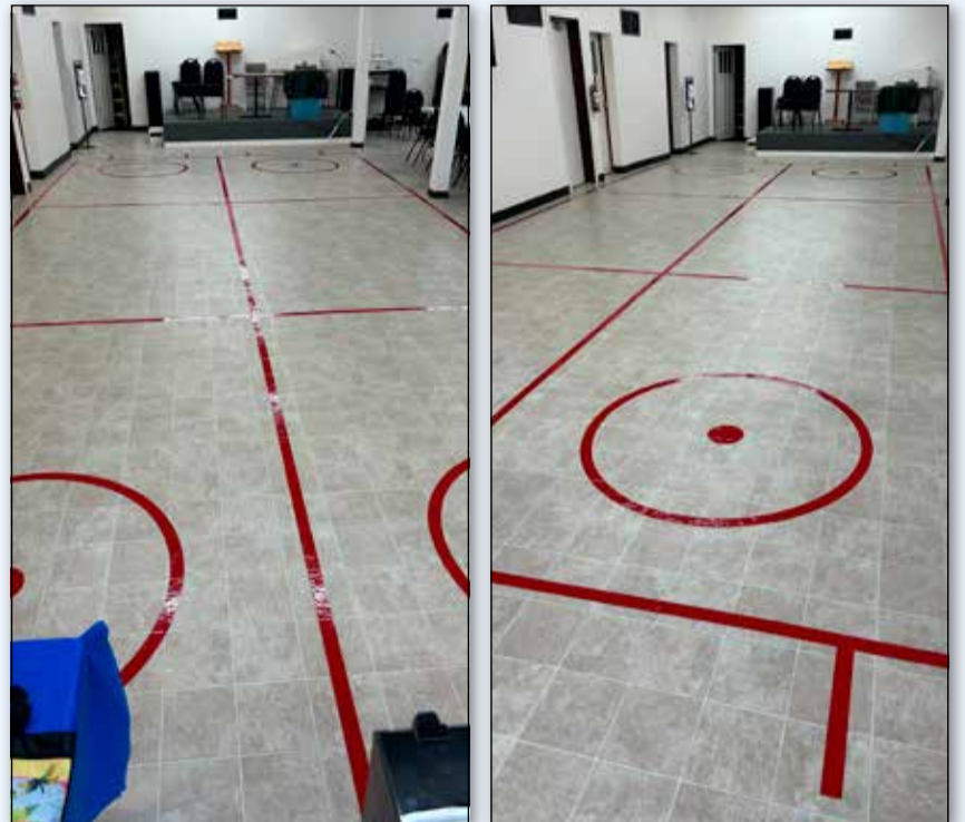
The floor is prepped and painted and the Thorhild Drop-In Centre is ready and excited to welcome players to their floor curling program. The program began December 3 and will be a drop-in program on Tuesdays at 1 pm.