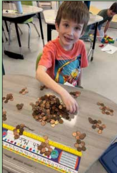
Grade 2 students at H.A. Kostach School had an exciting time exploring numbers and enhancing their counting skills through fun and engaging activities.