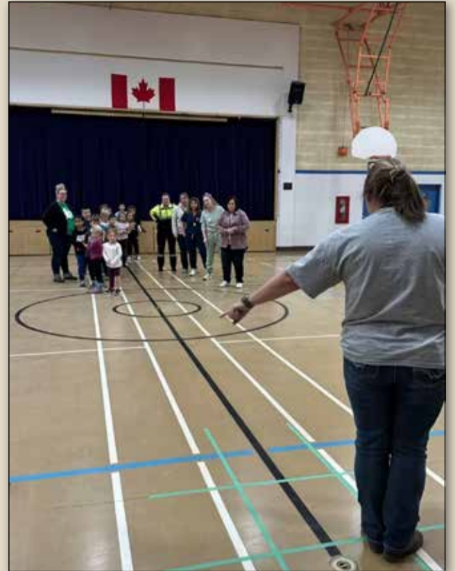
Team Green took on Redwater's first responders in an exciting conclusion to the week's Tic-Tac-Toe Showdown at Ochre Park School. The spirited competition highlighted the strong bond between the school and its community partners. A big thank you to the first responders for joining in the fun and supporting the school's events.