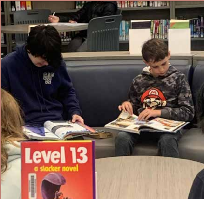
Last week, Redwater School's Grade five/six class participated in Read-In Week by spending time reading with the Grade nine students. The younger students enjoyed the opportunity to engage with their older peers, discussing books and sharing stories together. The activity not only fostered a love for reading but also helped build connections between different grade levels, making the experience both educational and fun for everyone involved.