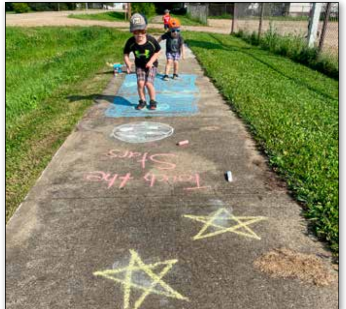
Children Enjoy a chalk obstacle course at the summer wind up at Newbrook Library.

Continued from page 1 community pools as the sun beat down on them. And this was all possible due to the dedication of individuals who valued time well spent in their summer, creating safe spaces of delightful fun. They delved into science, creating lava lamps and homemade bubbles. They enjoyed culinary delights and piled on the creativity of decorating