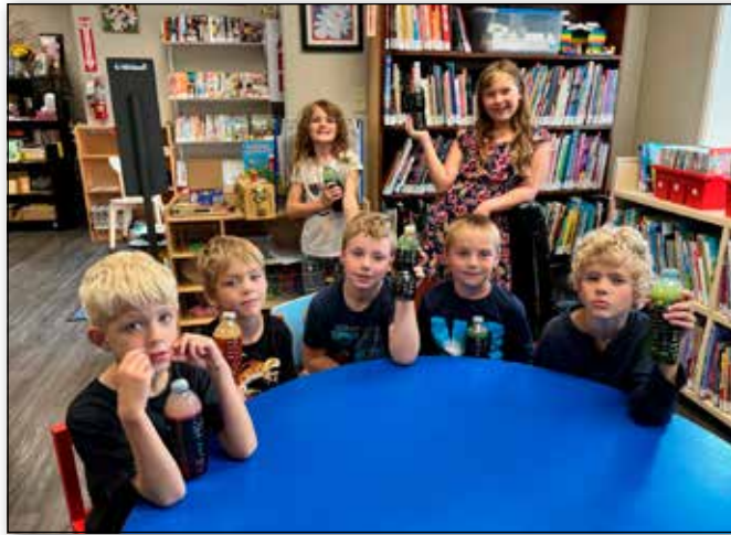
Radway Library celebrates the end of the summer with making homemade lava lamps and a pizza party.