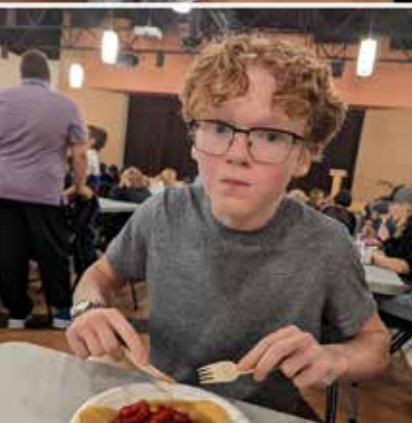
The Redwater School Renegades are welcomed back! Appreciation goes to the Town of Redwater and Redwater IGA for their support in assisting the student council in organizing a delightful pancake breakfast last Friday!