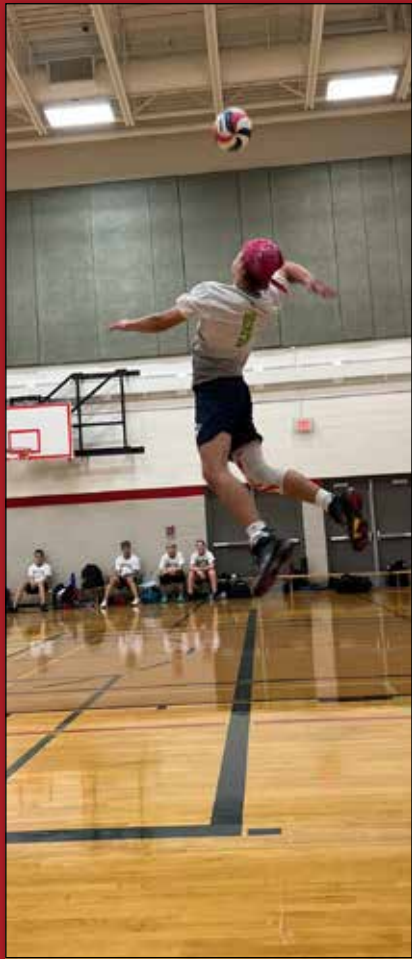
Last week, the senior boys' volleyball team at Redwater School secured two victories and suffered one defeat.