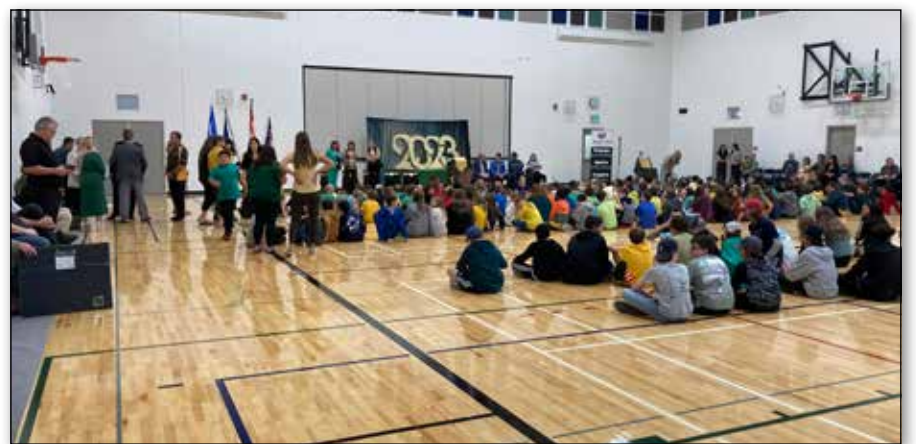
The immense gym quickly filled up with students from all grades.