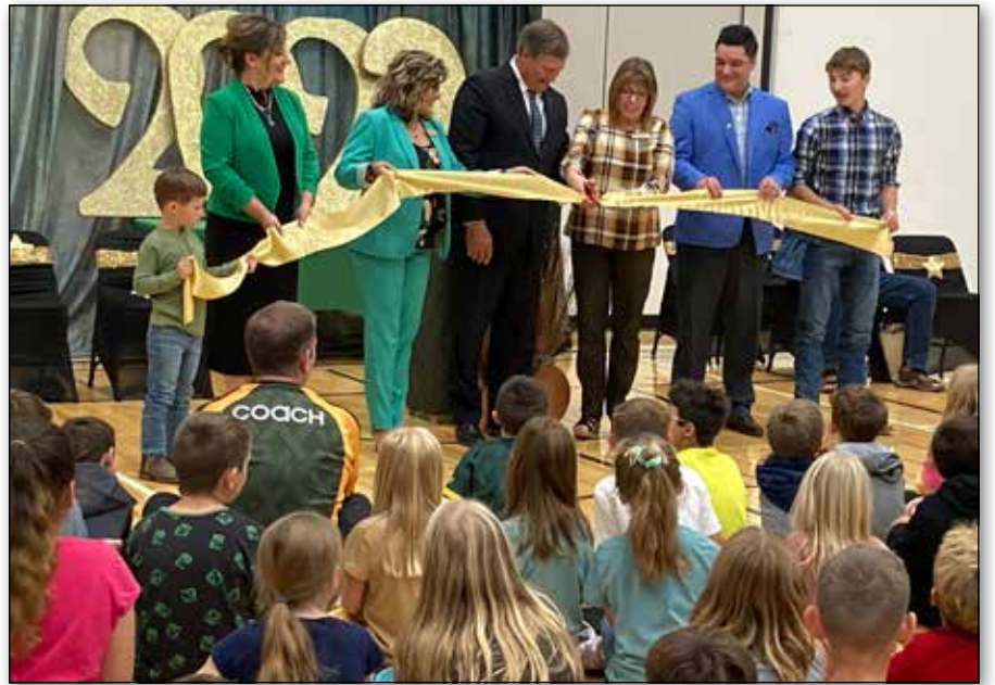
With the ribbon-cutting ceremony, the new HA Kostash school was officially opened.