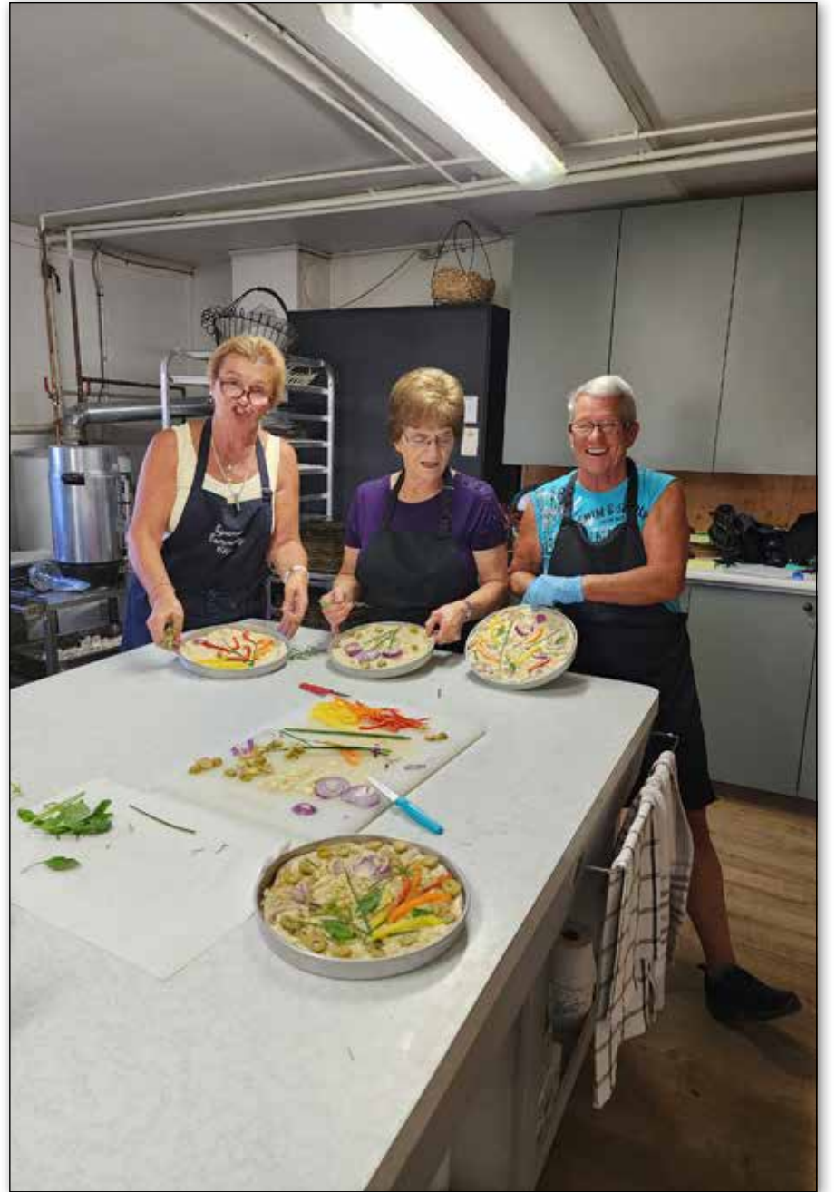
The Egremont girls were once again in the kitchen, preparing delectable focaccia bread for the harvest market.