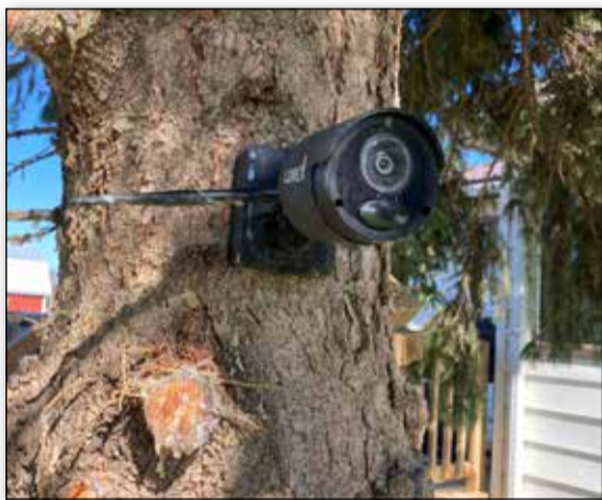
A video camera system can enhance security around a property and help RCMP reduce crime.

owner's property; the RCMP will not have live access to a person's camera feed. They will only ask for recorded videos; the video footage can be shared through the website for an officer to view before deciding if the video will help in their investigation; an officer can provide a person with a USB thumb drive to copy the video. An officer cannot download the video; they can only view it. This strategy is another way the Alberta RCMP works with communities to help solve crime faster. By providing video footage to police during an investigation, communities increase the chance of a successful prosecution. For more information on this program or to sign up, please visit the website at www.ruralalberta-capture.ca .