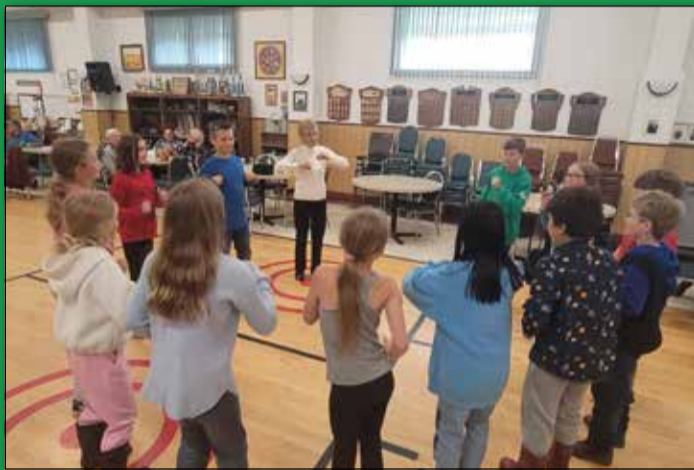
During their visit with community seniors, the grade four students of H.A. Kostash in Smoky Lake, showcased their talents through song performances and poetry recitations. The young students delighted both the seniors and themselves with their heartfelt and entertaining presentations. To add to the joyful experience, everyone indulged in delicious hot dogs, fostering a warm and inclusive atmosphere of intergenerational connection and camaraderie.