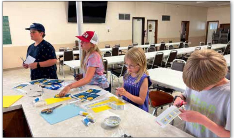
Captured in this photo are the dedicated members of the Kindness Crew, a group of children, collaborating harmoniously to craft the delightful lotions destined for the esteemed guests of the Senior's Tea.