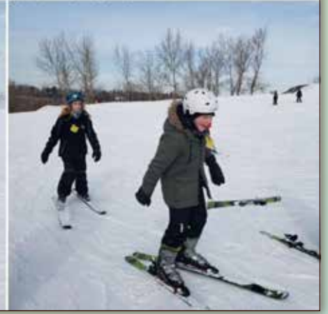
The Redwater School's elementary ski trip to Sunridge on Wednesday, March 15th was a tremendous success! The students had an amazing time skiing and enjoying the winter wonderland. The trip was not only a fun and exciting experience, but also an opportunity for students to learn and develop new skills.