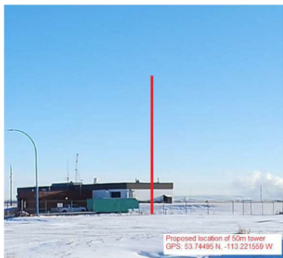
On-Line Station proposed 50-meter tower

Westcan ACS strongly support co-location on existing towers and structures as this minimizes the number of towers in a given area and is a more cost-effective way of building new infrastructures. Unfortunately, there were no structures in the area that met our network requirements. The tower is required to establish a wireless link for transmission of radio signals to continuously monitor the operations of the CRNWSC water distribution system and ensure uninterrupted supply of safe drinking water to the member municipalities served by the CRNWSC.