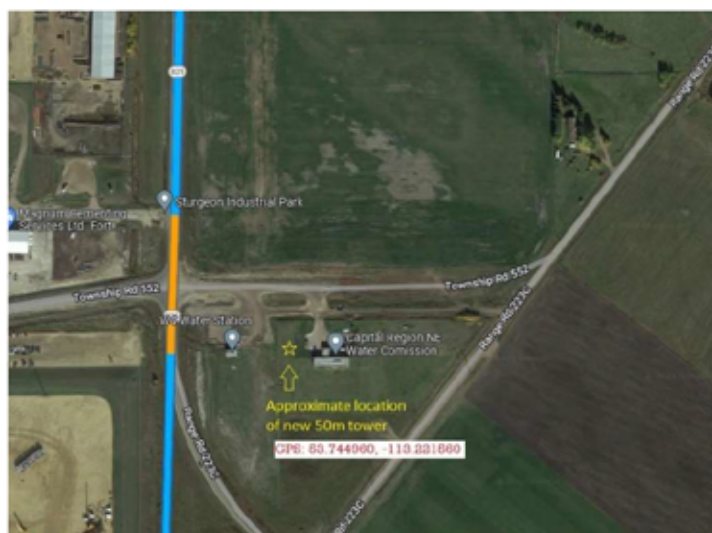
CRNWSC Vicinity Map

Westcan ACS attests that the radio antenna systems described in this notification package will comply with Health Canada's Safety Code 6 limits, as may be amended from time to time, for the protection of the general public including any combined effects of additional carrier co-locations and nearby installations within the local radio environment. For more information on Safety Code 6, please visit the following Health Canada site: https://www.canada.ca/en/health-canada/services/environmental-workplace-health/radiation .