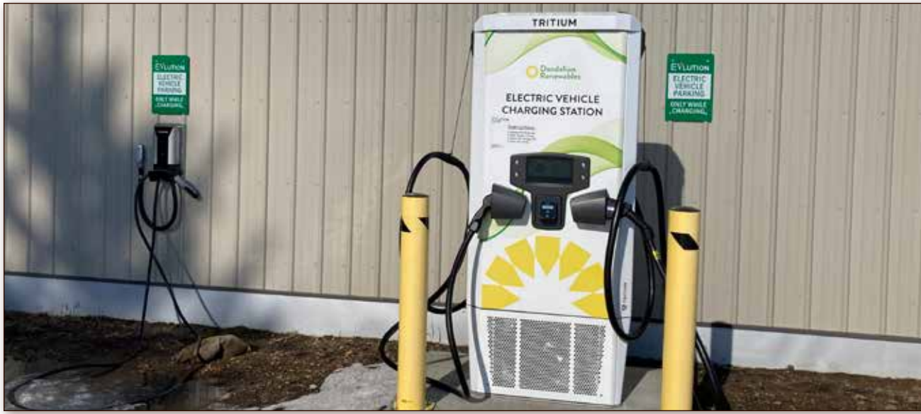
Electric vehicles need charging stations to keep going. The level determines the charging speed and action radius of the vehicle. This level-three charging station in Smoky Lake ensures maximum charging speed.