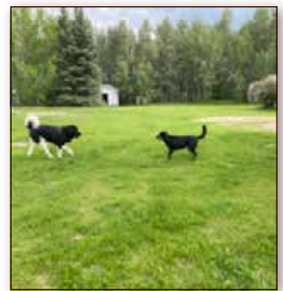
At Longrange Kennels the owners give dogs lots of time to socialize and play outside.