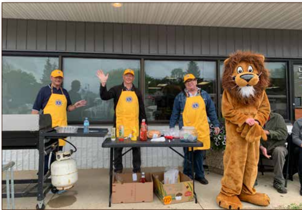
The Lion's Club was busy serving free hot dogs on July 7 in support of the "Word-on-the-Block" summer block party.