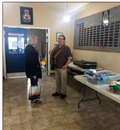
The Redwater Farmer's Market is at the Legion every Tuesday from 4:00 pm till 6:30 pm. Stop by for a piece of pie & coffee.