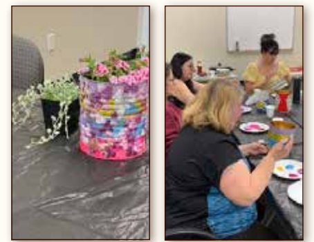
Attendees, socializing and working hard on plant crafts with the Find your Village community program.