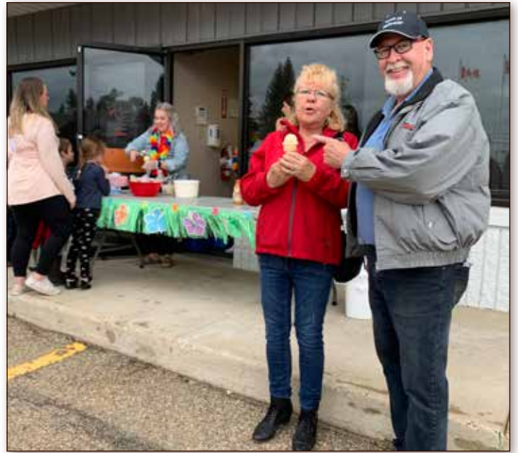
The Town of Redwater hosted its very successful ice cream day on July 7 at the Town office.