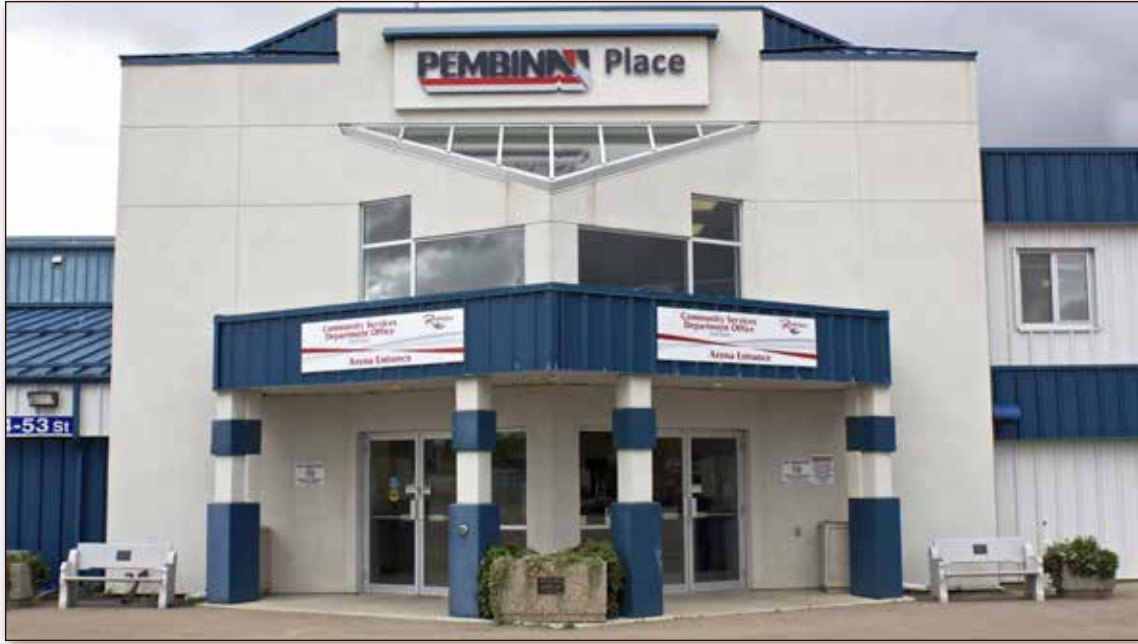
Pembina Place is the perfect place to host recreational, educational, social, and cultural events. Now offering summer programs for children! Check it out at redwater.ca